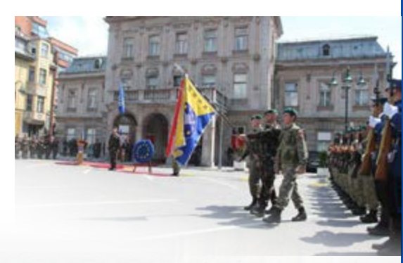
EUFOR's Multinational Battalion (MNBN) is marched on to parade