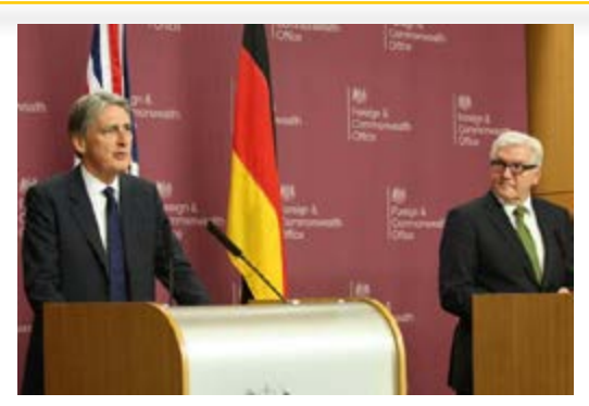
British and German Foreign Ministers Hammond and Steinmeier

waste and stagnation, we urged politicians to sign up to substantial reforms and offered BiH the opportunity to make progress towards EU membership. BiH has submitted an application for EU-membership. This is good news. But a lot remains to be done! Not only on socio-economic reforms but also regarding rule of law. More than one year ago Bosnian politicians committed themselves to reforms closely linked to the Compact for Growth and Jobs. The main focus is on the labor market, social security systems, the rule of law and the fight against corruption. State and Entity Governments started implementing some of the reforms contained in the reform agenda that was agreed in July 2015. The last EU-country report on Bosnia and Herzegovina asserted that BiH is back on the reform track. However, being on track doesn't mean that the finish-line is close, a lot remains to be done".