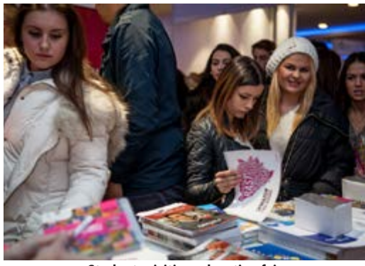
Students visiting education fair

Building on the successes of previous fairs held in Zenica and Banja Luka, the Mostar Fair allowed participants – youth, students and unemployed – to identify and develop their own talents in various on-site workshops, explore up to 1,500 jobs and educational opportunities, and establish professional networks.