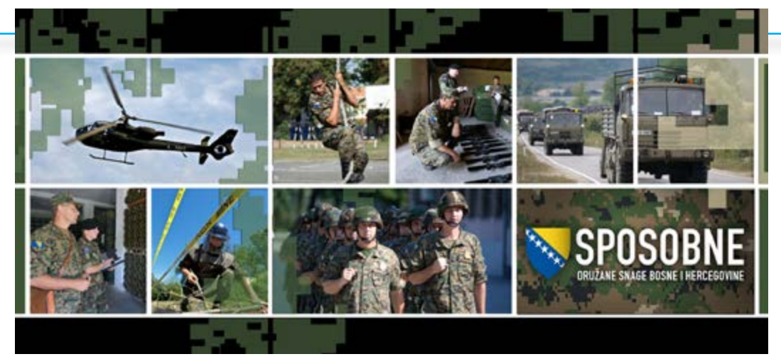
Capacity Building and Training billboard

Five participants were trained from the Logistics Command and one participant from the AFBiH Joint Staff J4 (Logistics Group). This included exercises in organizing, planning and executing of tasks related to documents preparation, packing and loading of equipment, transporting and escorting assets and equipment transported within and/or beyond state borders.