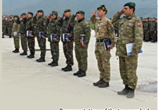
Representatives of the troops which took part in the exercise

On the 22nd of October a closing ceremony was held for Exercise "Quick Response 15". The ceremony was presided over by Commander EUFOR who made a concluding speech thanking the personnel attending for their efforts during the exercise. The ceremony featured all the soldiers who took part in this year exercise, including personnel from Slovakia, Turkey, the United Kingdom and Key Leaders from Romania and Bulgaria.