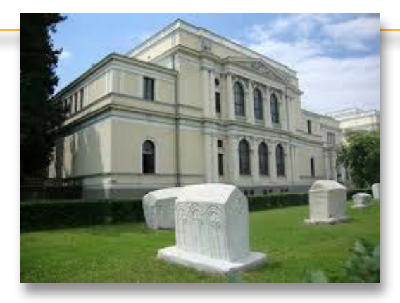
The tomb stones exhibition was open to the public in 1913.

The Botanical Garden is an unusual living exhibition with 2000 different plant species. The Department of Natural Sciences keeps the world-famous entomological collection of more than 500,000 insects, a herbarium with 160,000 plants of which modern science considers many as endangered, rare or missing. The zoological department keeps the largest white sharks caught in the Adriatic Sea, and two preserved Mediterranean monk seal captured more than 100 years at the mouth of the Neretva River amongst its collection.