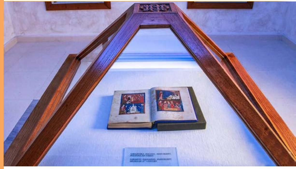
One of the most important exhibits in the museum is the famous Sarajevo Haggadah, the traditional Jewish book by the Sephardim brought to Sarajevo from Spain

A special symbol of the National Museum of Bosnia and Herzegovina is the oldest scientific Herald of the National Museum, which has been published since 1889. The Museum has a library exchange with nearly 600 institutions in the world - museums, universities, galleries, institutes, national libraries on all continents.