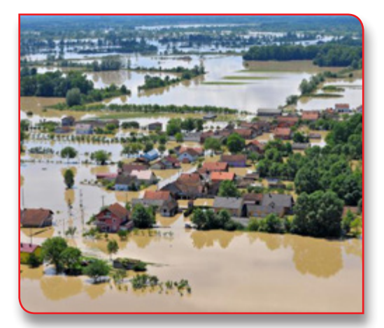
Observed from the air, almost a third of Bosnia chiefly in the northeast resembles a huge muddy lake, with houses, roads, and rail lines submerged.

EUFOR representatives were continuously monitored the situation after receiving initial