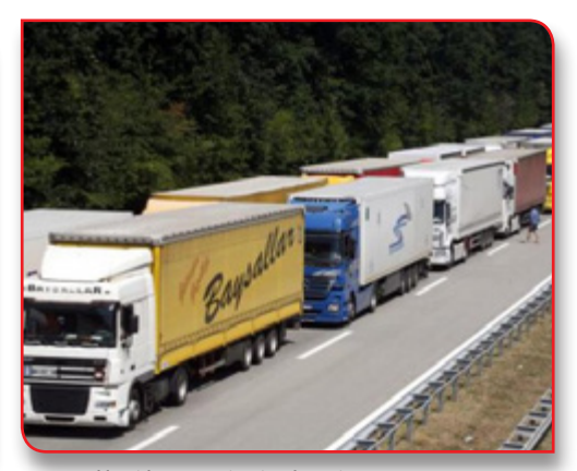
20 tons of food for BiH and Serbia from the Former Yugoslav Republic of Macedonia

Slovenia provided a rescue unit with four boats and two helicopters including crews and equipment necessary for evacuation.