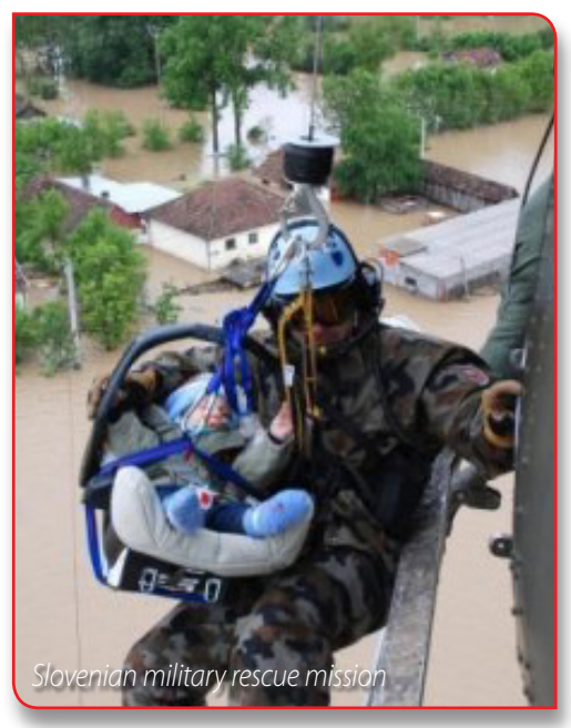
Dramatic moment - three month old baby is winched to safety in Šamac

The Former Yugoslav Republic of Macedonia offered a team with 30 members and 6 boats as well as humanitarian aid. Montenegro sent humanitarian aid as well.