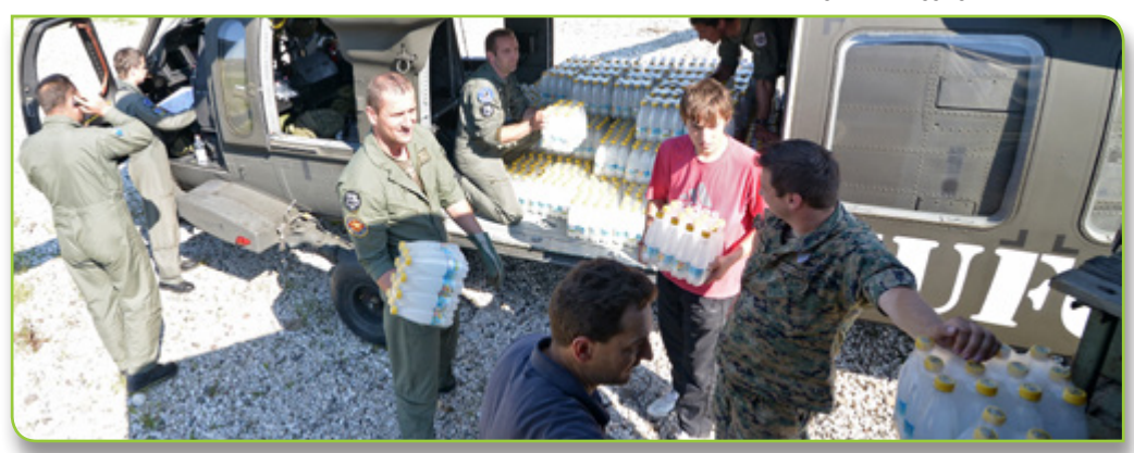
Multinational troops working together in Šamad