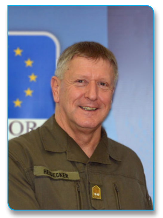
Major General Dieter Heidecker

Being a visible part of the European Union's comprehensive approach in Bosnia and Herzegovina, EUFOR lent its support to the rescue and disaster relief efforts of the local authorities. Initial activity consisted in transporting approximately 140 tons of relief supplies to the population and the Armed Forces BiH, moving rescue teams into position and evacuating approximately 900 people to safety in a very short time, including medical evacuation. During the exercise "Joint Effort" - conducted with the Armed Forces BiH and three EUFOR reserve companies from UK, Slovenia and Austria – our main effort was on removing debris and waste from homes and businesses, disinfection as well as on transporting aid and reconstructing roads.