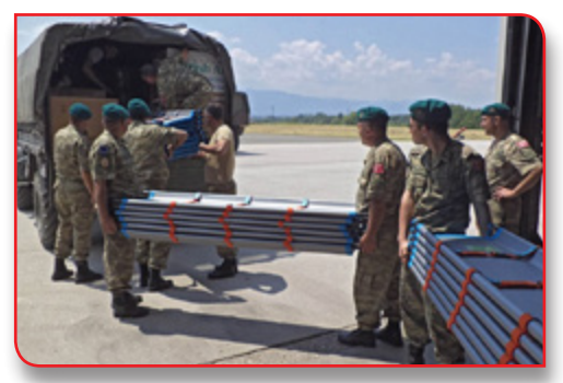
EUFOR's Turkish Company transported humanitarian aid from Tuzla airport to Maglaj, Žepče, and Doboj. The aid goods mostly consisted of generators, medical equipment, blankets, food and sleeping bags.

what worked well, and where improvements can be made so that we are even better placed in the future to deal with such an event.