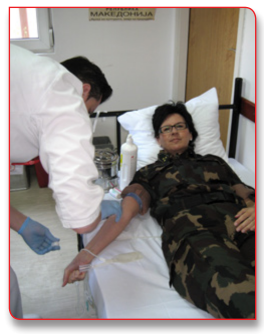
When you donate blood regularly, you truly contribute to a continuous flow of life