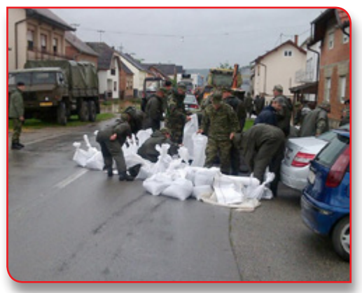
Troops from Croatia

The Croatian Government provided two helicopters of the Croatian Air Force, with 2 crew members and 2 teams for search and rescue. In total, 15 members of the Croatian Armed Forces have been deployed in BiH, made around 200 flights, transported about 500 people, and 90 tons of various materials.