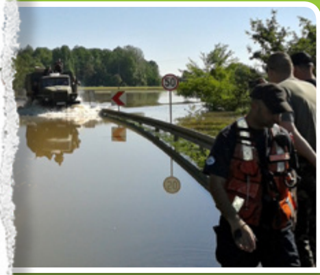
Where roads have been passable, trucks from the EUFOR Multinational Battalion have been used to transport a number of supplies including boats and engineering equipment.