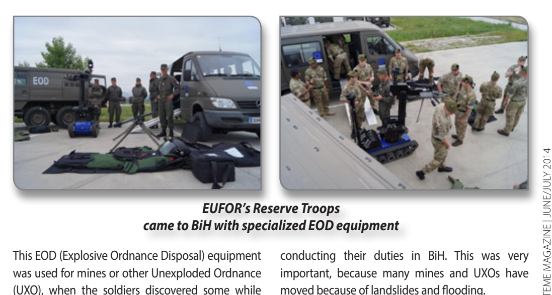
EUFOR's Reserve Troops came to BiH with specialized EOD equipment

waste and deliver humanitarian aid". Deanović stated. BiH Defense Minister Zekerijah Osmić stated that AFBiH are ready to resolutely, bravely and selflessly continue to assist the affected people. 'The Exercise confirms our aspiration to actively take part in mitigating the disaster which hit BiH with all our available resources', Osmić said