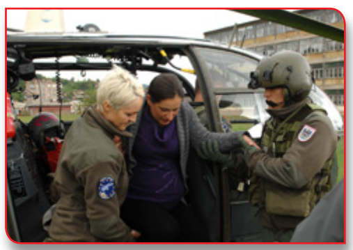
Timely movement and care was provided by medical personnel to injured and sick people.

During the flooding, EUFOR helped to conduct medical evacuation over many days, using the helicopter asset which is constantly available as an element of EUFOR capability. The EUFOR medical evacuation team, consisting of three doctors and two flight rescuers, provided immediate medical aid on the evacuation flights of the EUFOR helicopters. Hundreds of civilians, including children and the older people, received emergency treatment and were transported to hospitals.