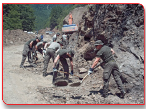
The Austrian Reserve troops deployed for roads reconstruction

what worked well, and where improvements can be made so that we are even better placed in the future to deal with such an event.