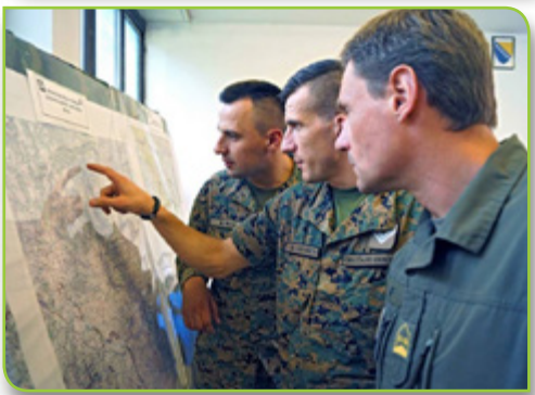
The exchange of information is very important