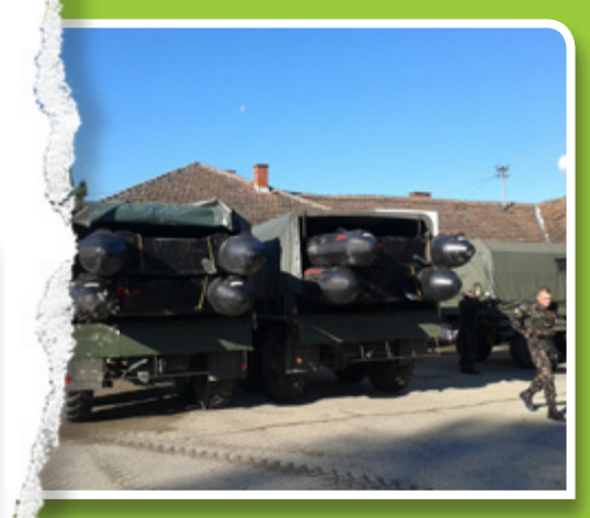
Boats from rafting companies in the Konjic area have been transported by EUFOR trucks to support evacuation of personnel