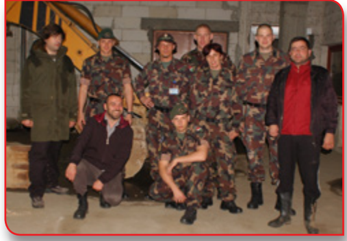
Hungarian contingent assists in flooded areas