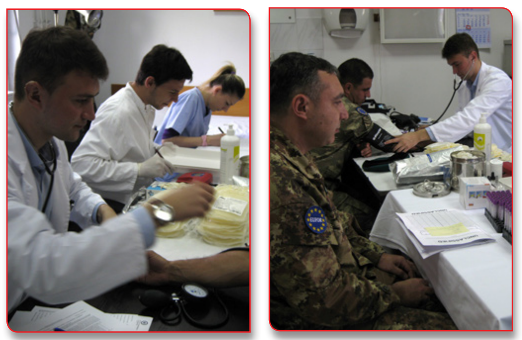
One injured adult person may need 40 units of blood in case of emergency