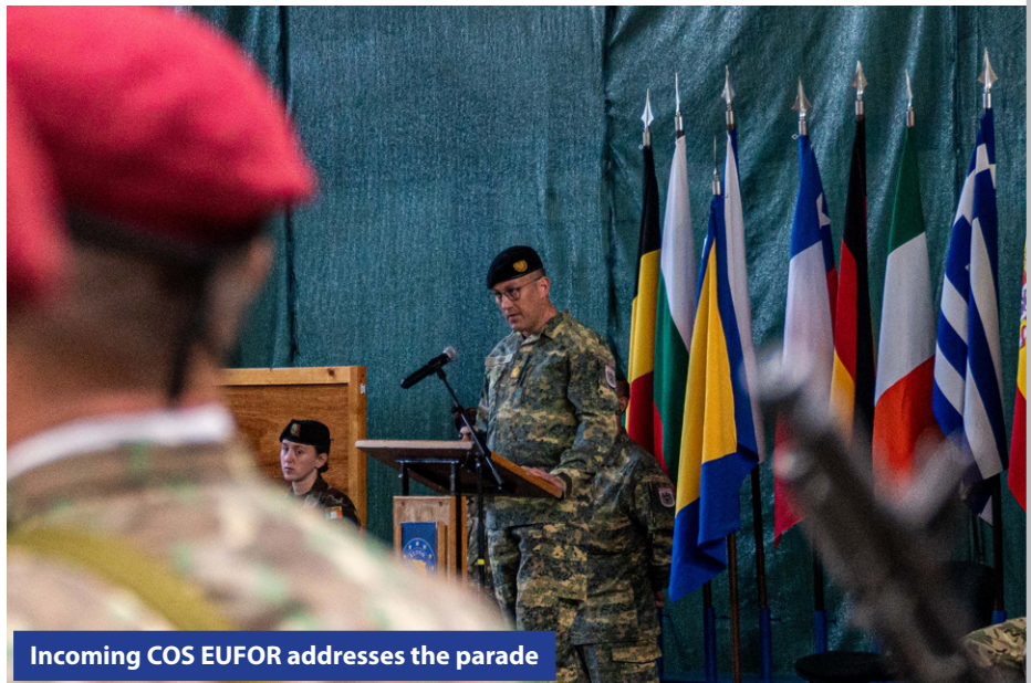
Incoming COS EUFOR addresses the parade