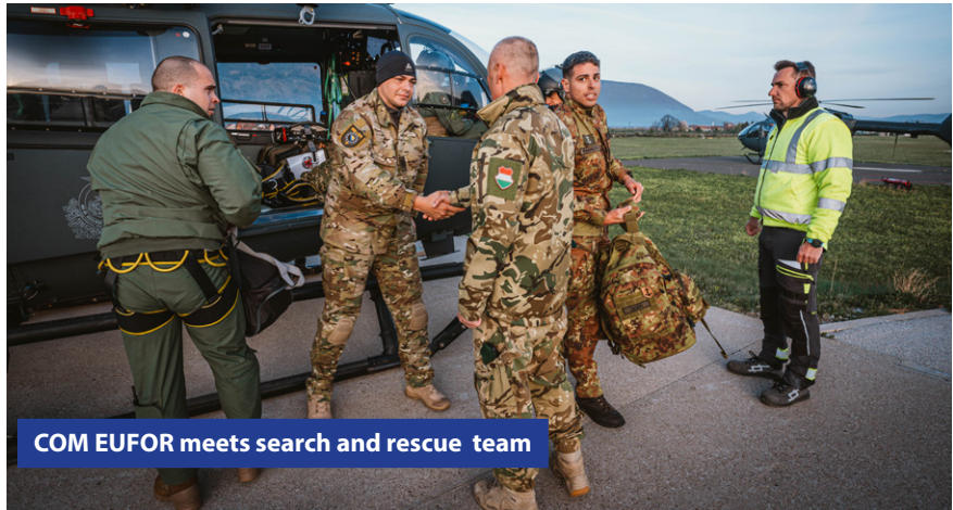
COM EUFOR meets search and rescue team

EUFOR is ready 24/7 to support the authorities of BiH – Forward, Onward, Together!