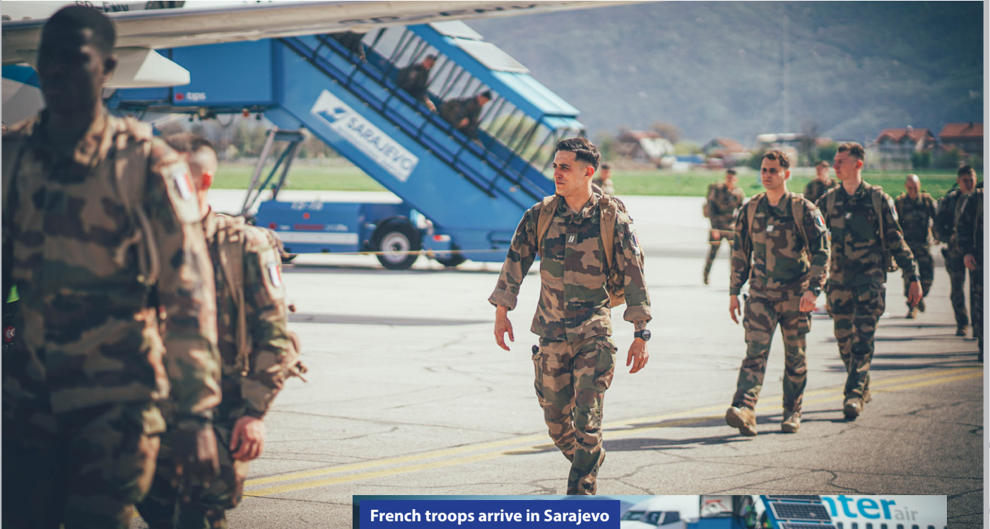
French troops arrive in Sarajevo