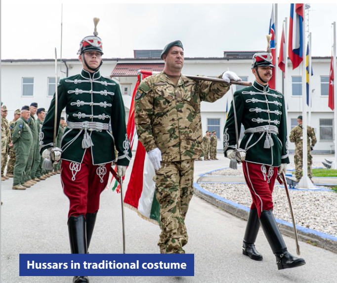
Hussars in traditional costume