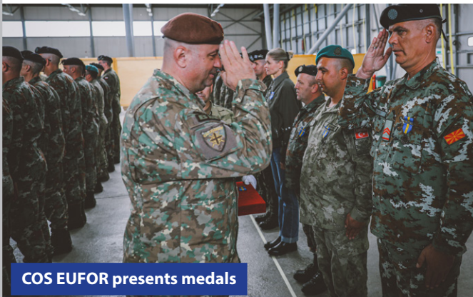
COS EUFOR presents medals