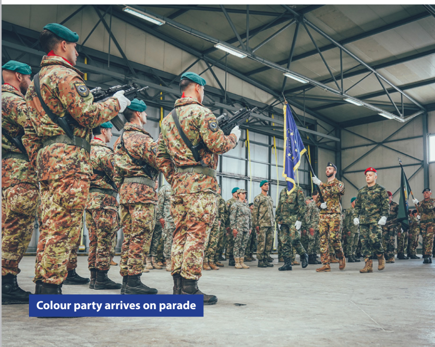
Colour party arrives on parade