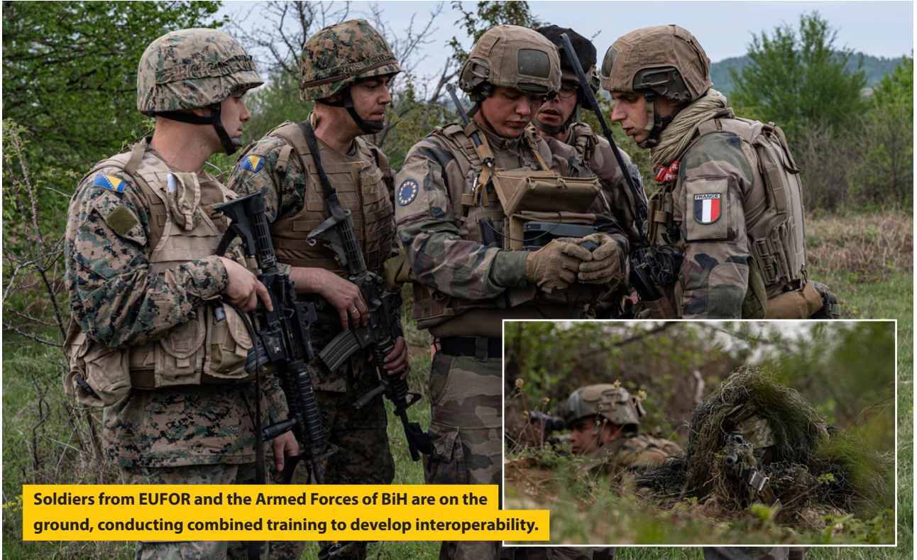
Soldiers from EUFOR and the Armed Forces of BiH are on the ground, conducting combined training to develop interoperability.