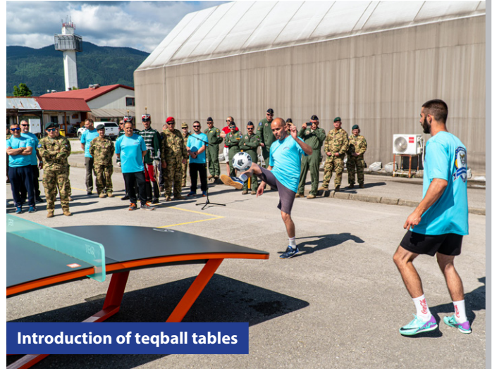
Introduction of teqball tables

This year, with the aim of establishing a tradition, all 23 nations of EUFOR are invited to organize a national week where they can introduce their national customs to their comrades.