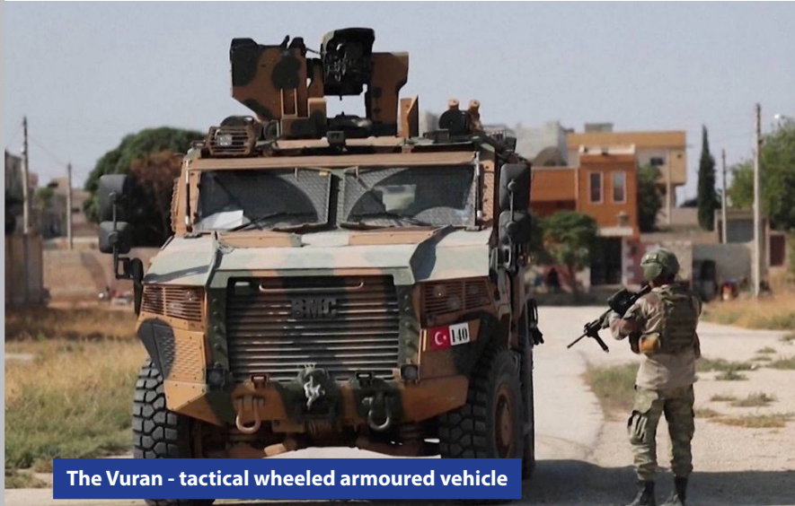
The Vuran - tactical wheeled armored vehicle

Entirely designed by BMC in Türkiye, the vehicle features a robust and sturdy structure, standing at a height of 3.2 meters. Its armor complies with STANAG 4569 Level 3 (MRAP) standards.