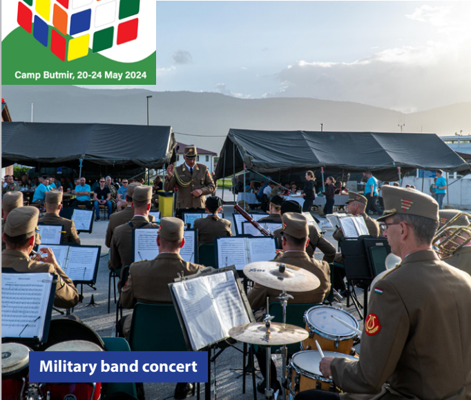
Military band concert