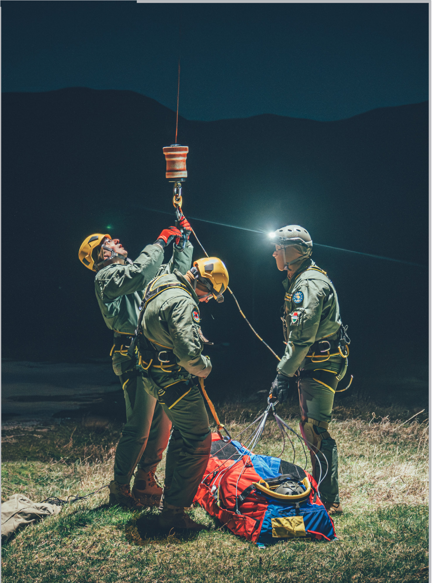
Heli MEDEVAC Training