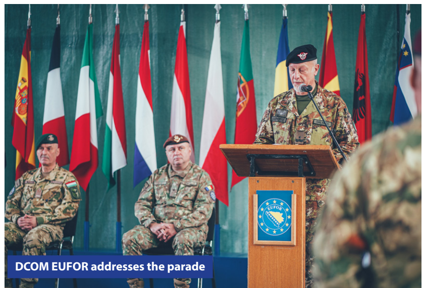
DCOM EUFOR addresses the parade