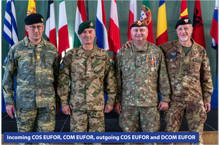
Incoming COS EUFOR, COM EUFOR, outgoing COS EUFOR and DCOM EUFOR