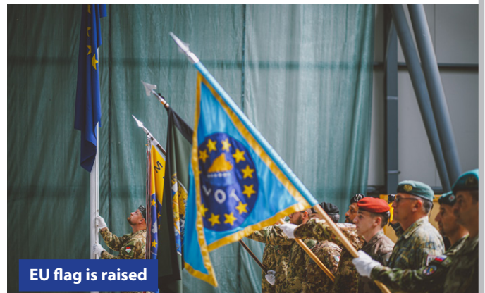
EU flag is raised