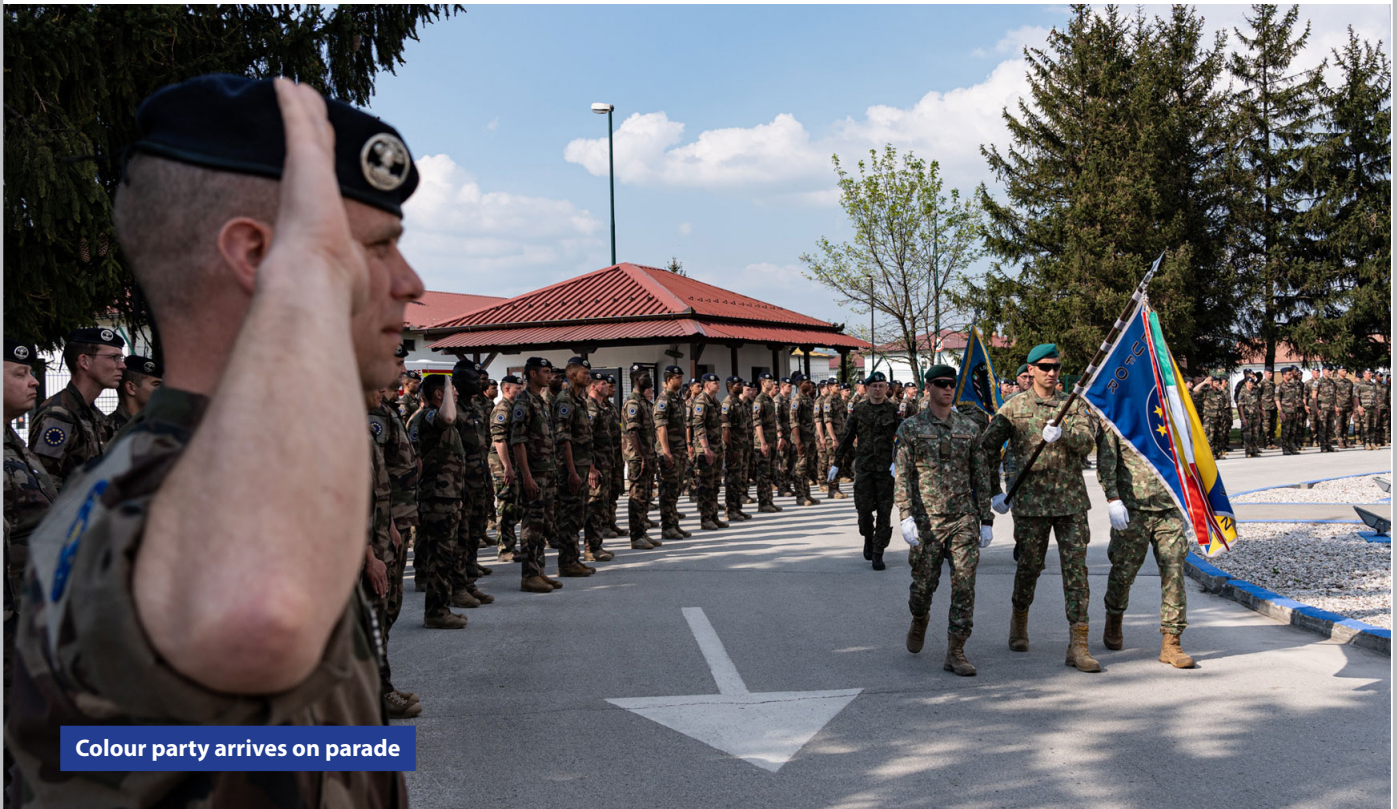
Colour party arrives on parade