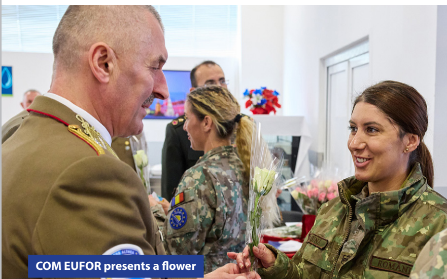
COM EUFOR presents a flower

“The presence of female soldiers, marines, sailors and aircrew improves access to community members, amplifies situational awareness and provides necessary balance in times when peacekeeping success relies greatly on an ability to communicate with and adequately absorb concerns of the entire population”