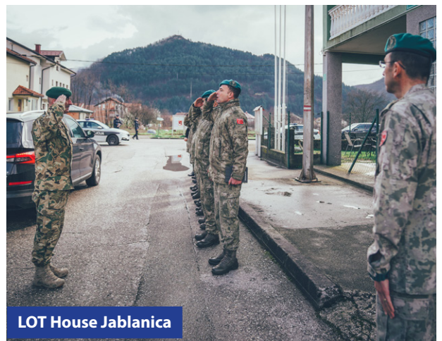
LOT House Jablanica