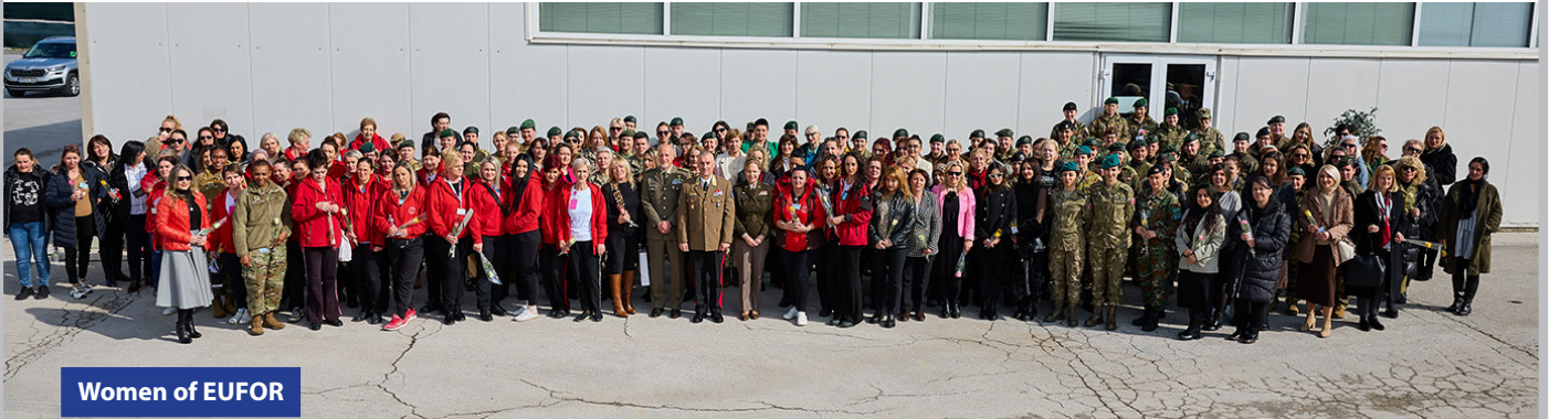
Women of EUFOR