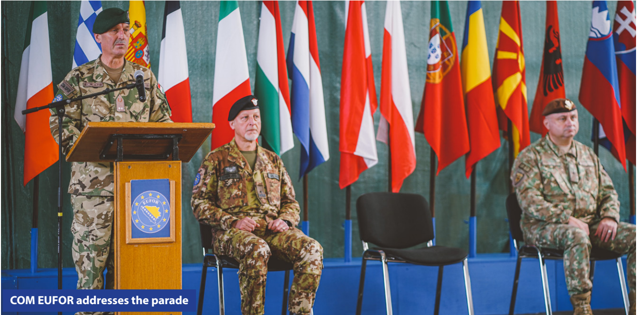
COM EUFOR addresses the parade

An international medal parade was held in Camp Butmir where members of EUFOR from Greece, North Macedonia, Poland and Türkiye received the European Union's Common Security and Defence Policy Medal (CSDP) for Operation Althea in recognition of their service in as part of EUFOR in Bosnia and Herzegovina.