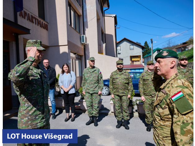
LOT House Višegrad

the Coordination Centre is responsible for the whole geographical area of BiH. Knowing what is important to the people of BiH enables EUFOR to provide support in maintaining a safe and secure environment in Bosnia and Herzegovina.