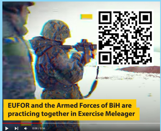
EUFOR and the Armed Forces of BiH are practicing together in Exercise Meleager