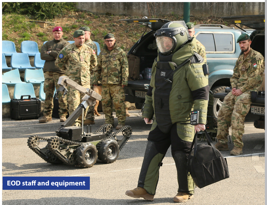
EOD staff and equipment