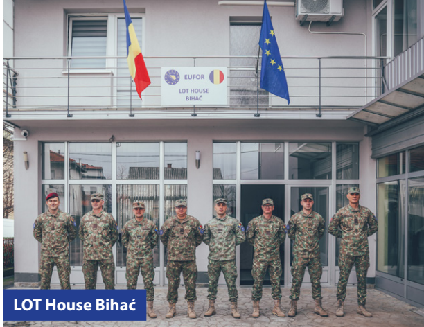
LOT House Bihac

EUFOR is committed to maintaining a safe and secure environment (SASE) in Bosnia and Herzegovina and EUFOR's Liaison and Observation Teams (LOT) are one tool which EUFOR utilizes to do this. LOT houses are located all over the country of Bosnia and Herzegovina and serve as EUFOR's link to the local communities and authorities. They play a vital role in identifying threats to the safe and secure environment in BiH. There are 19 LOT houses in BiH which are operated by soldiers from Germany, Switzerland, Türkiye, Romania, Austria, Poland, and Slovenia.