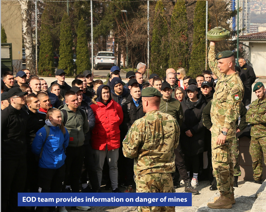
EOD team provides information on danger of mines