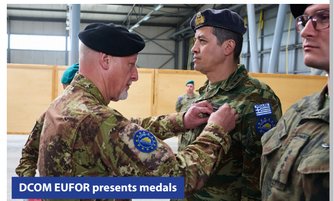
DCOM EUFOR presents medals