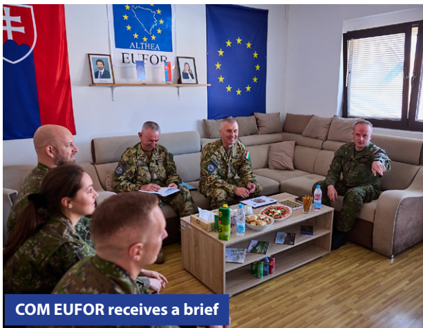
COM EUFOR receives a brief

LOT houses are guided by the Coordination Centre in Camp Butmir, Sarajevo. This Coordination Centre has been installed as a part of EUFOR to have full and timely situational awareness related to events in BiH and to propose actions related to security issues. While the EUFOR LOT houses have a limited area of responsibility,