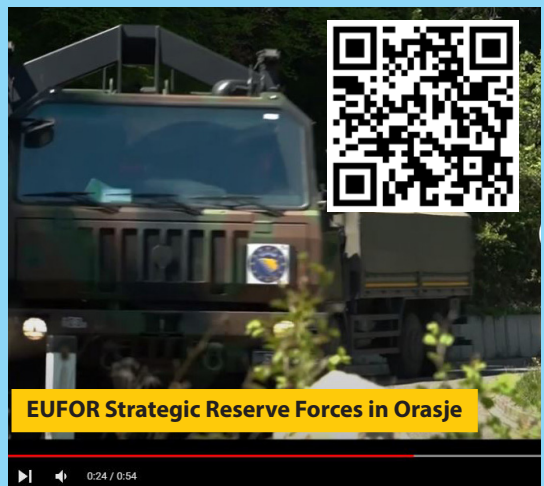
EUFOR Strategic Reserve Forces in Orasje