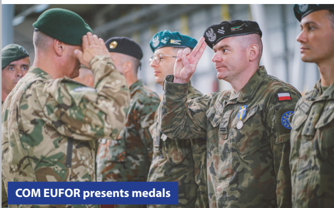
COM EUFOR presents medals