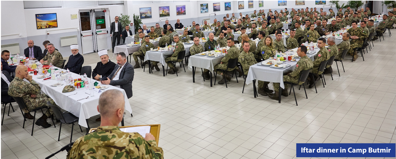
Iftar dinner in Camp Butmir

EUFOR recognises the importance of embracing and celebrating the diversity of religious traditions of its Troop Contributing Nations and the people of Bosnia and Herzegovina. A number of different religious celebrations has been hosted in Camp Butmir.