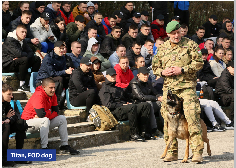
Titan, EOD dog