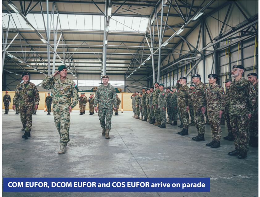
COM EUFOR, DCOM EUFOR and COS EUFOR arrive on parade

EUFOR is a strong, capable and reliable partner to the BiH and remains committed in supporting the authorities of BiH in maintaining a safe and secure environment.