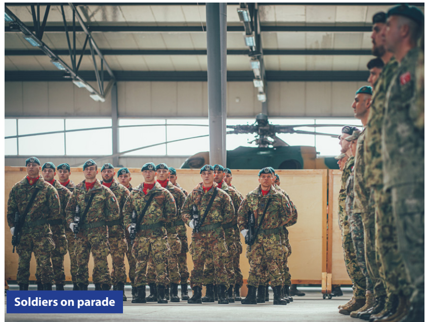
Soldiers on parade