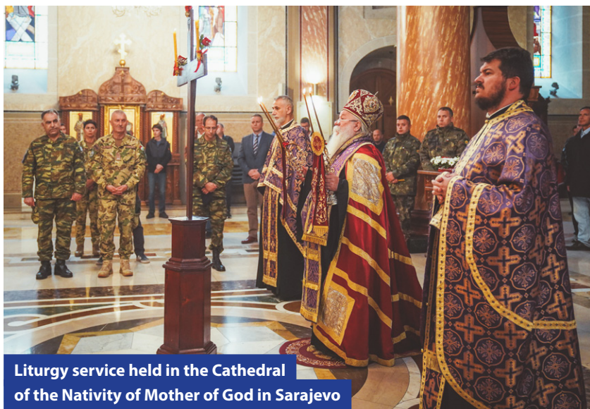
Liturgy service held in the Cathedral of the Nativity of Mother of God in Sarajevo

These types of celebrations help to enhance mutual respect and cooperation not only within EUFOR but also with the authorities and the people of Bosnia and Herzegovina.