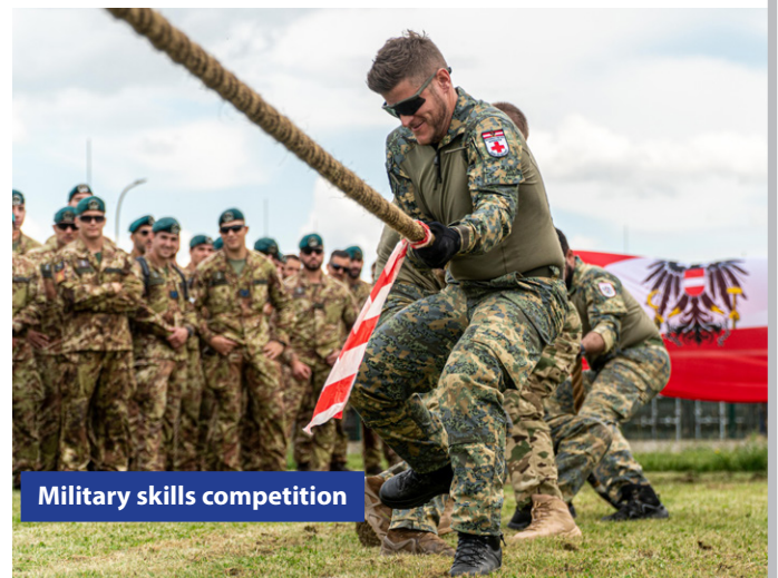
Military skills competition