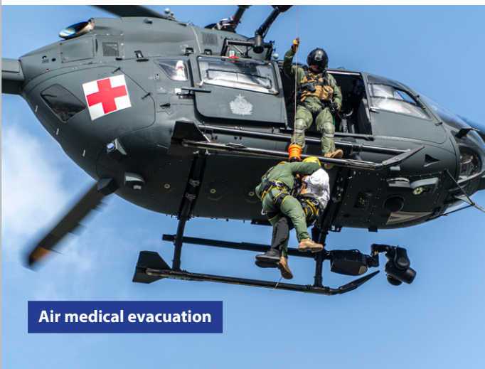
Air medical evacuation