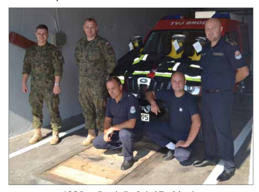
LCC Donations to the Doboj Fire Brigade

Although significant, the above mentioned challenges did not have a negative impact on Safe and Secure Environment.