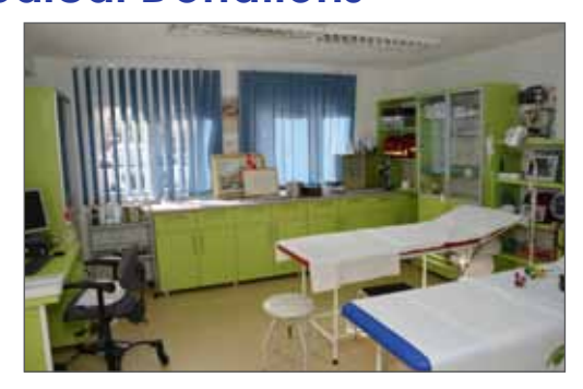
Stolac Health Care Center

Funds raised by Turkey have been used to improve the capacity of two Bosnian Health Care Centers. The Health Care Center in Stolac has been renovated and two Dialysis Machines