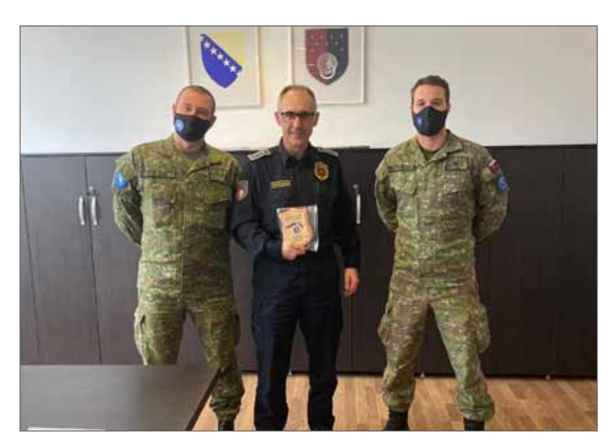
LOT Team members meeting with Sarajevo police counterparts

The year 2020 was particularly challenging in the LOT Cazin area of operation where EUFOR