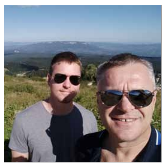
A Trip to up to Jahorina

every operation has its own special charm and individual character depending on the commander, the situation and your comrades. It was a very similar situation at the time. Just like now, after discussing it, my son gladly accepted my proposal to deploy to Bosnia with my unit as a driver for 6 months, bridging the gap between School and University. Uniquely, at that time (2015) there were three fathers deployed to EUFOR with their sons.