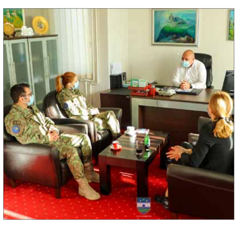
LOT Team Meets with the Una Sana Canton Authorities

The 2020 year and the COVID-19 pandemic brought a dramatic interruption to the normal pattern of life for Liaison and Observation Team Coordination Centre (LCC) and the 17 Liaison and Observation Teams (LOT) across Bosnia and Herzegovina. Gone were the familiar routines, abruptly replaced with the need for flexibility and initiative. Old habits were made redundant and new forms of communication were pushed to the fore.