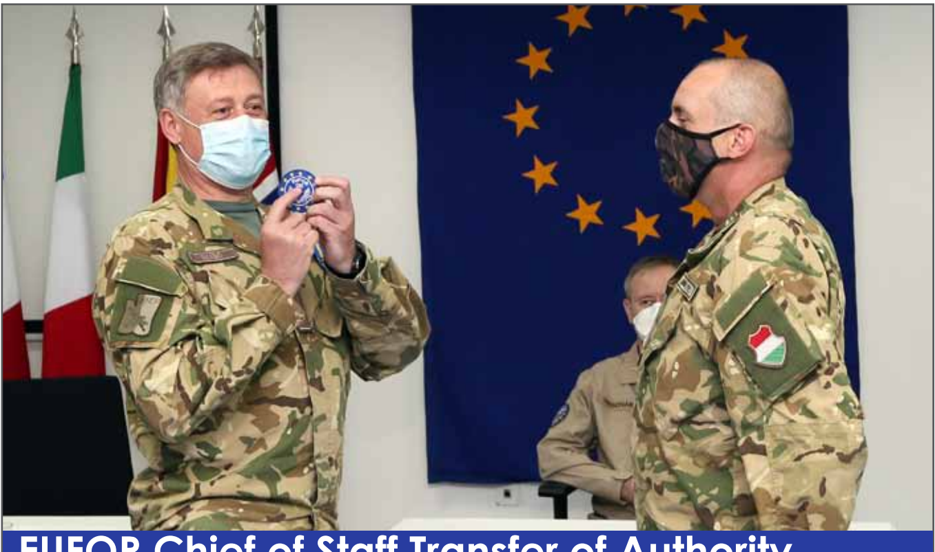
EUFOR Chief of Staff Transfer of Authority