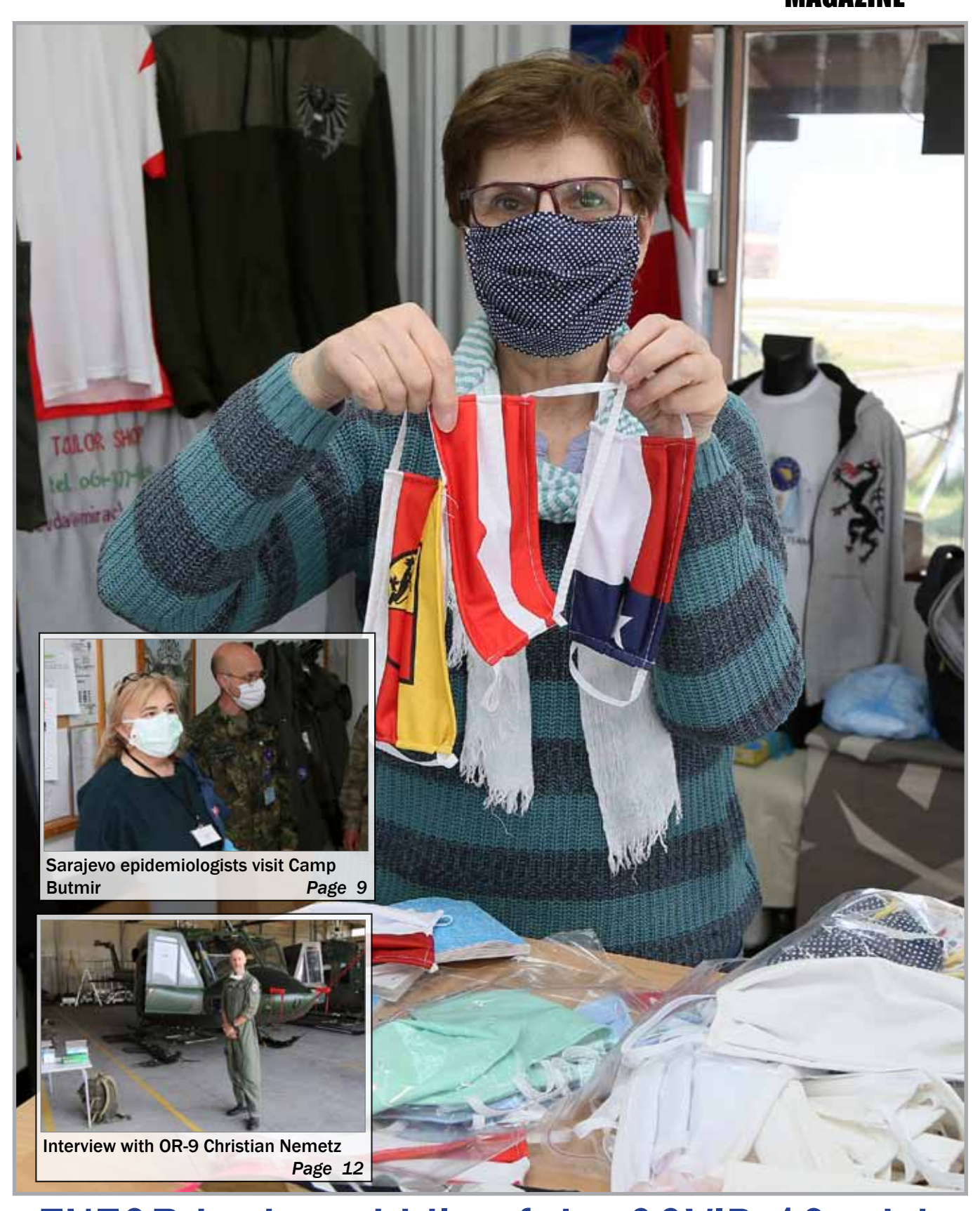
EUFOR in the middle of the COVID-19 crisis