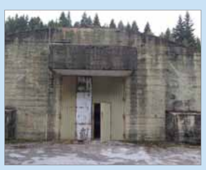
This building looks to be in reasonable condition from the front...