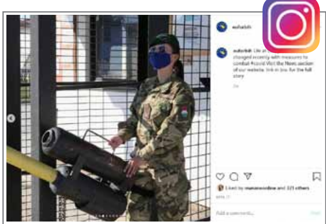
EUFOR and Camp Butmir adapt to life during COVID-19