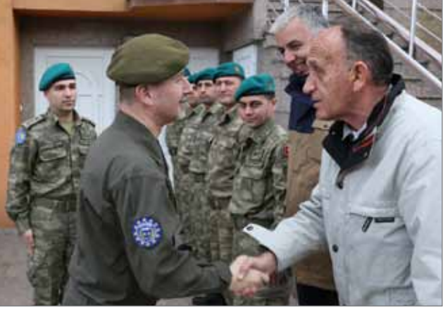
LOT House Zenica

more than 15,000 individuals per year; including vulnerable