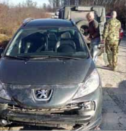
The pair of travelers involved were not so lucky, as there appeared to be significant damage to the Peugeot car.