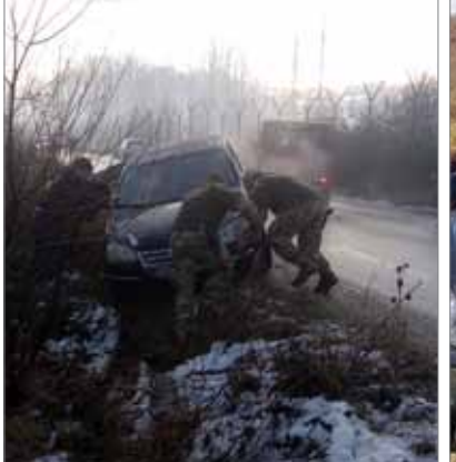
Stopping to provide assistance, the patrol found two male passengers requiring help to get their car back on the road.