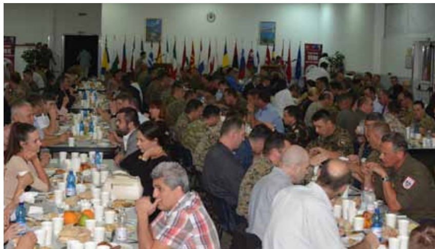
Guests enjoy the IFTAR meal in the DFAC 'Banja Luka' restaurant