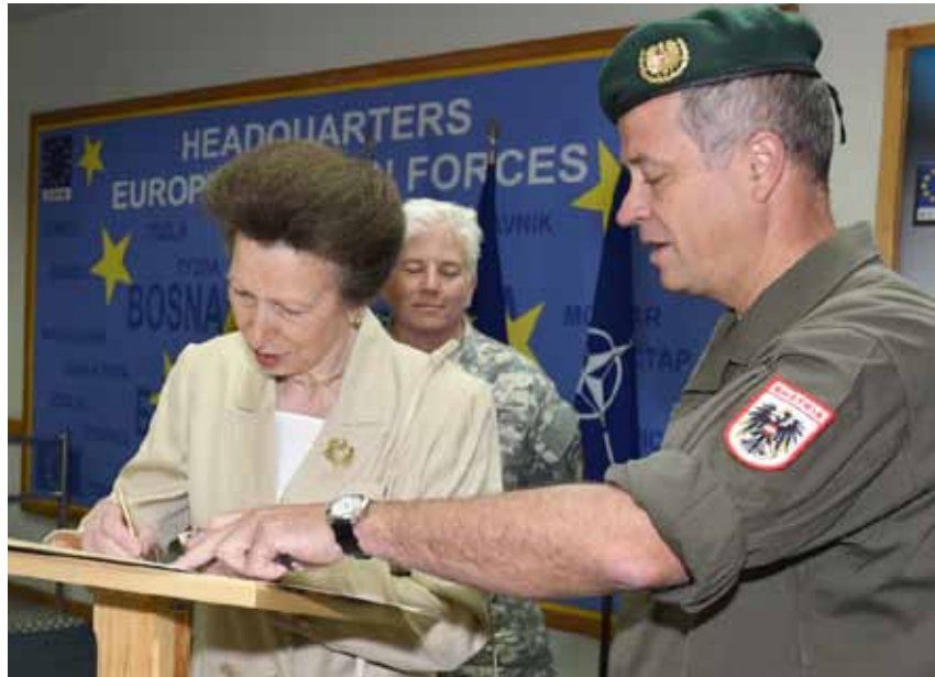
Her Royal Highness the Princess Royal signs the EUFOR guest book at the entrance to Building 200

A number of the guests present had met with her previously in