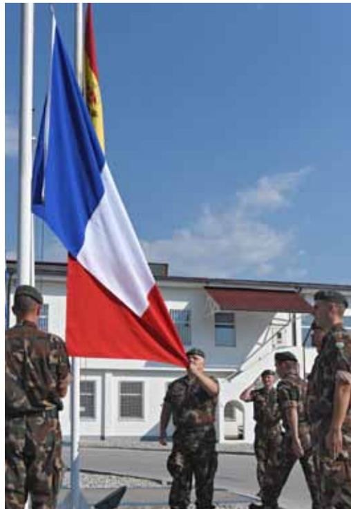
EUFOR soldiers lowering the French flag during the ceremony

The departure of the last French military person from EUFOR brings to an end a commitment that has been unbroken for 23 years. During the course of this service, 116 French soldiers lost their lives, a fact that is recognised by a memorial within Camp Butmir.