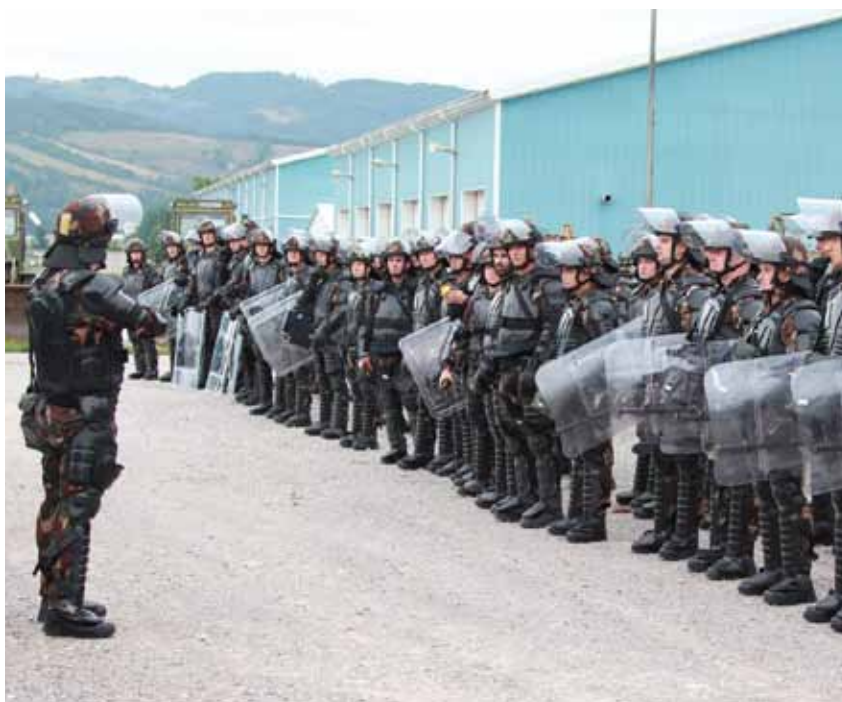
Hungarian soldiers receive a briefing during the exercise

On the 18th of August 2015 the Hungarian company of the EUFOR Multinational Battalion took part in an evaluation exercise held in Rajlovac barracks. In a specially prepared area the Hungarian company encountered a realistic scenario, and were given tasks by the Multinational Battalion staff.