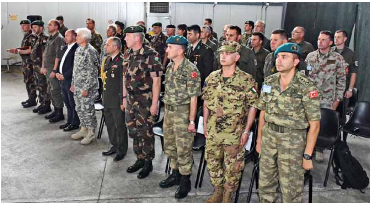
Guests stand to attention as the MNBN flag is paraded