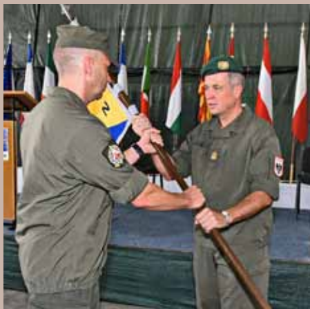
MNBN Change of Command Ceremony

“Summer afternoon - the two most beautiful words in the English language”