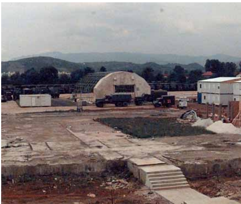
Construction of Butmir 1. In 1997 Camp Butmir began to be used as a Logistics base by SFOR.

During the conflict the area that would become Camp Butmir was located at the front line (or separation zone) between the opposing forces. Heavily impacted by mines and unexploded ordnance, this former Yugoslavian Special Police Force base would eventually be taken over by SFOR in 1997.