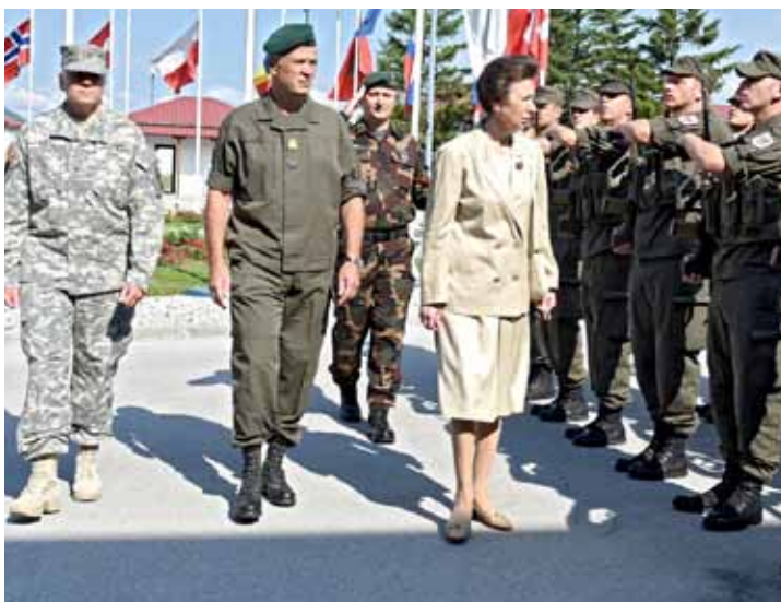
The Princess receives a salute from the Austrian honor guard