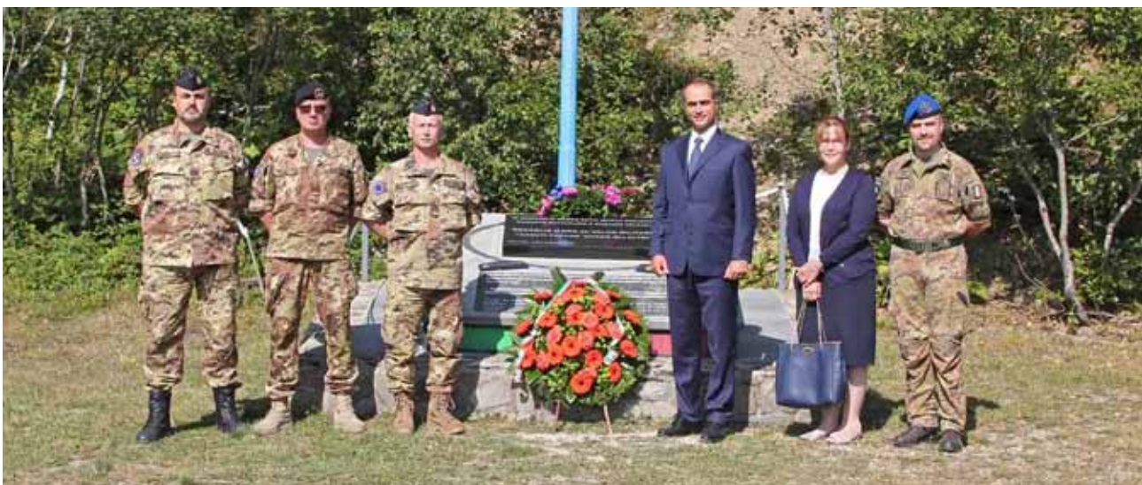
Italian EUFOR members alongside the Ambassador at the ceremony