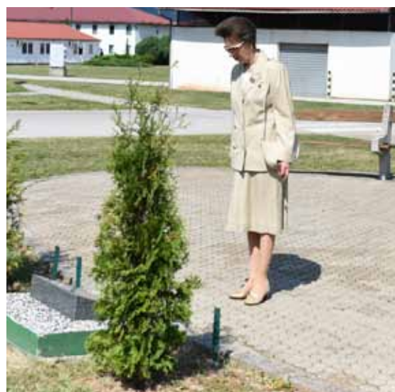
The Princess pays her respects at the UK memorial