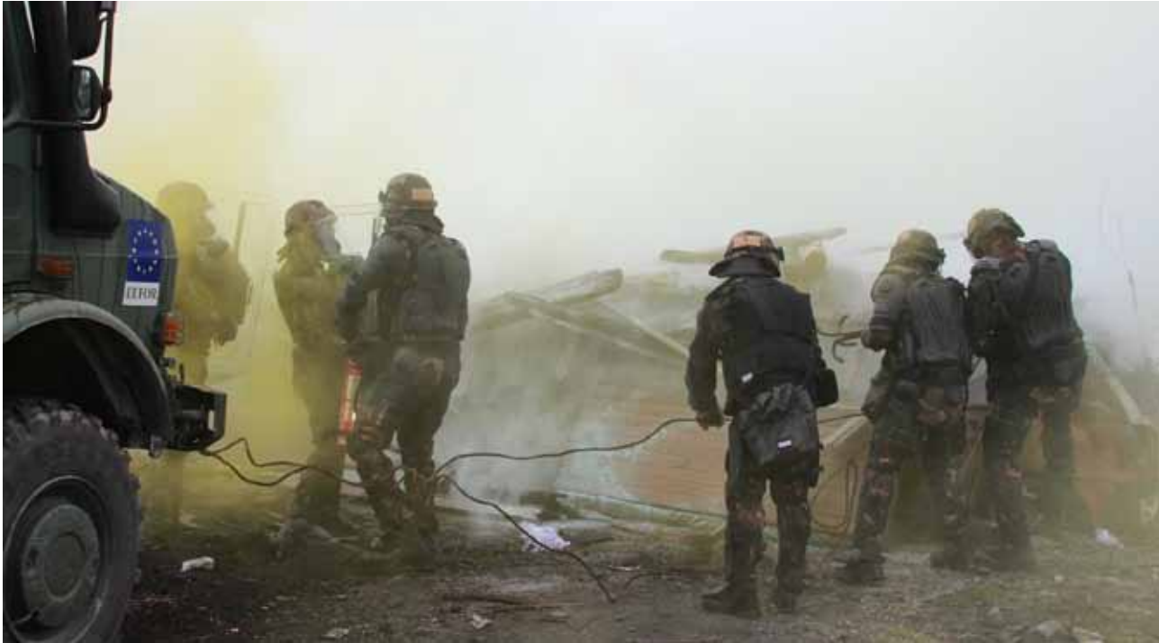
Soldiers clear a blockage from the road during the exercise

Operational capability and are able to fulfil all tasks given to them.