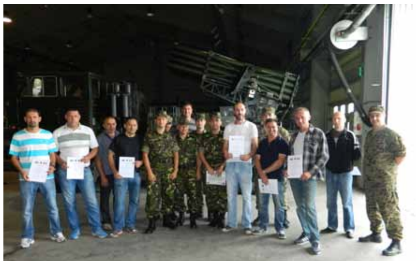
Successful AFBiH participants receive certificates of course completion