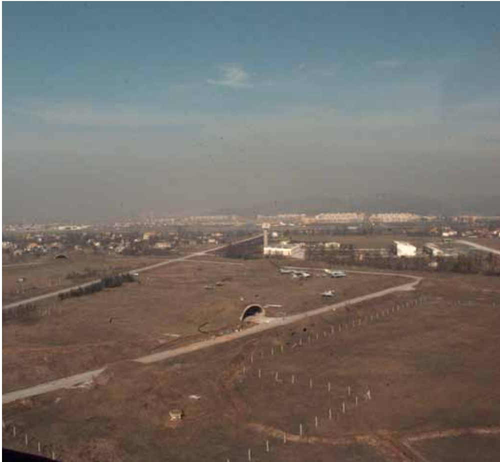
Aerial view over Butmir 2 prior to occupation, including military aircraft shelters for MIG aircraft visible today. The current DFAC building is visible in the background, at the time of the photo used as the boiler room. The tower is a cooling tower for the boiler.