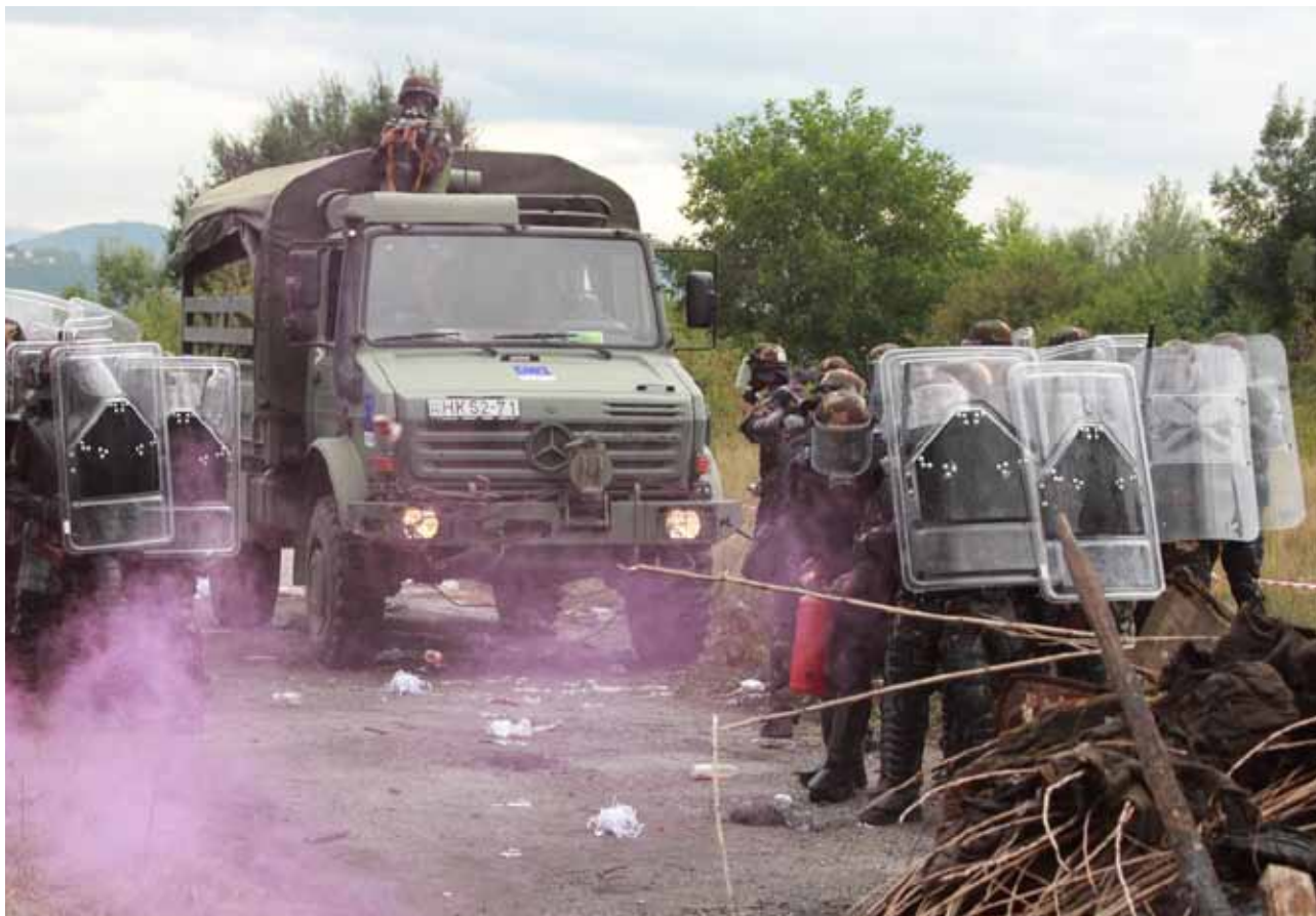
MNBN Hungarian soldiers during the simulated Crowd Riot Control part of the exercise