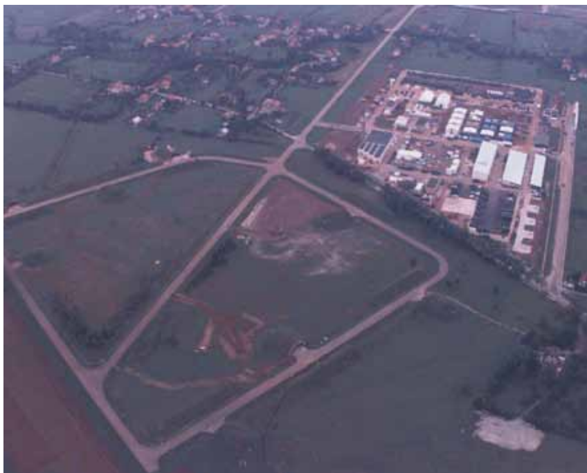
Aerial view of Butmir 2 after the construction of Butmir 1.