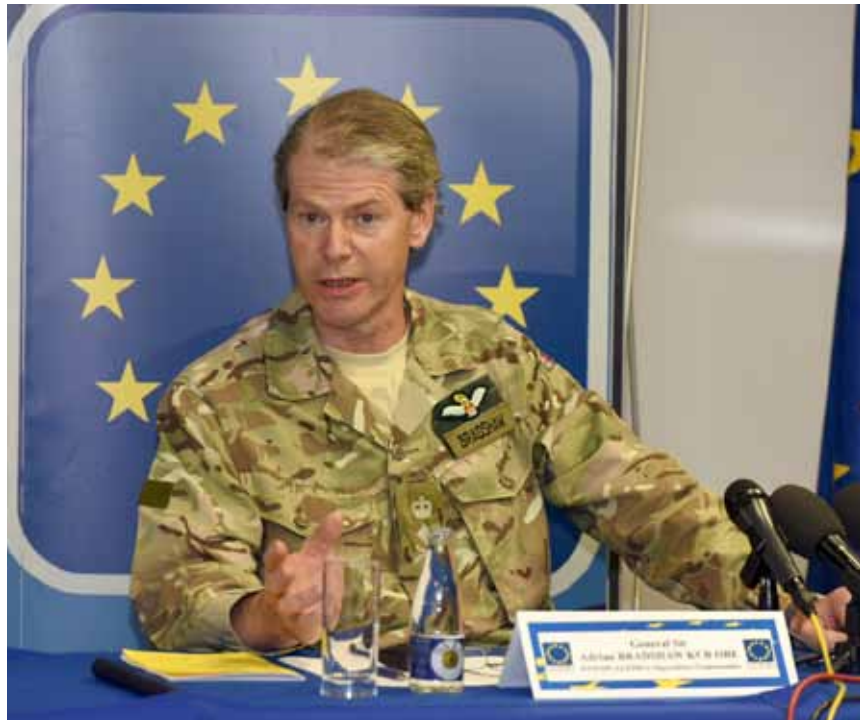
General Bradshaw answers questions from the assembled television and print media

The 2014 Exercise Quick Response coincided with heavy flooding in the country, and