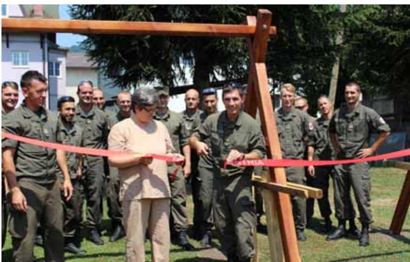
The Austrian CIMIC team open the climbing frame alongside members of the MNBN