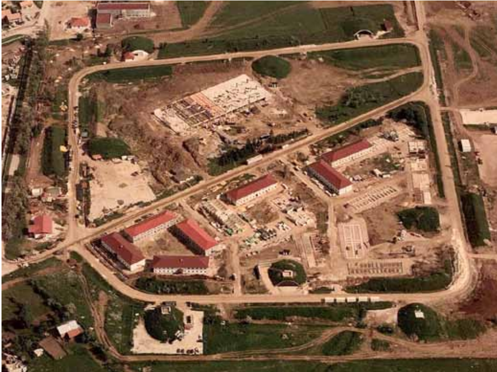
Aerial view over accommodation buildings. The foundations of Building 200 are being constructed at the top of the image.

A MIG 21 located in the Butmir 2 area, alongside unexploded ordnance prior to occupation.