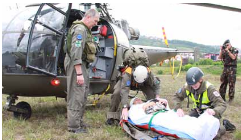
Austrian personnel conduct Medical evacuation