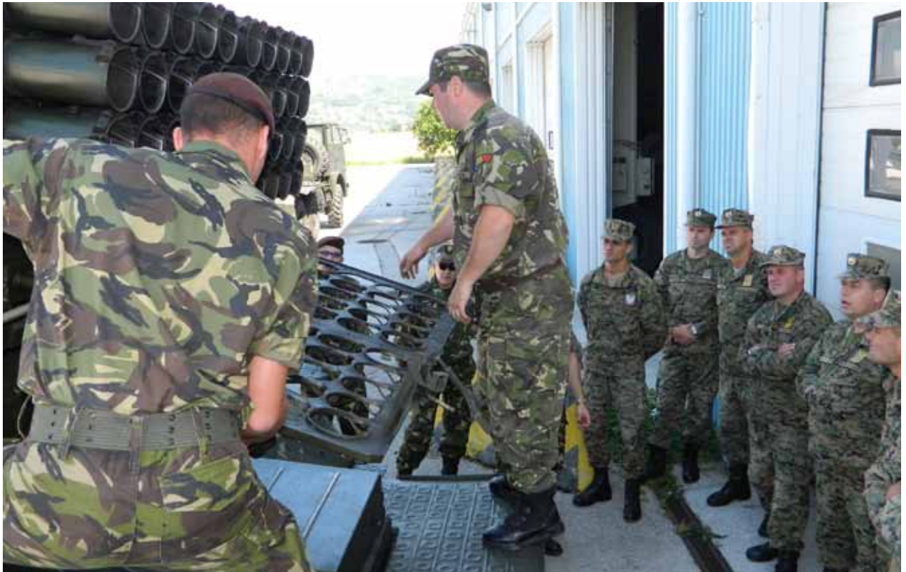
AFBiH soldiers look on as a Romanian instructor explains the system

On the 31st of July a closing ceremony for Romanian led APRA (a multiple launch rocket system) training course was held, celebrating the successful completion of the courses by AFBiH personnel. This closing ceremony encompassed the third iteration of the System Handling and Maintenance Course' and the second and third level Maintenance Course.