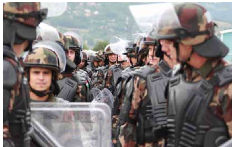
Hungarian MNBN soldiers assemble