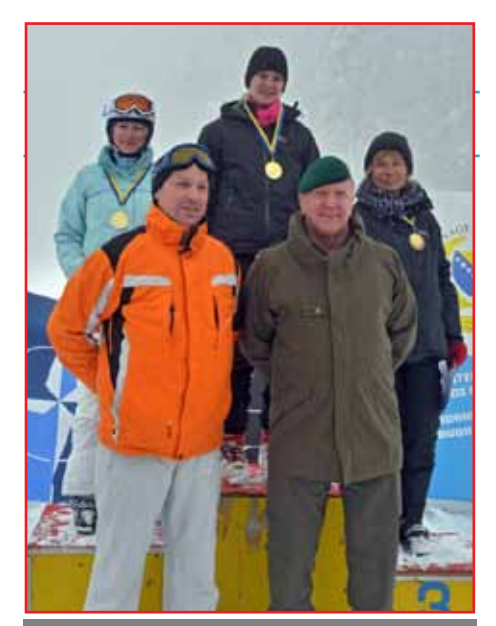
Bjelasnica Inter-military Ski Competition