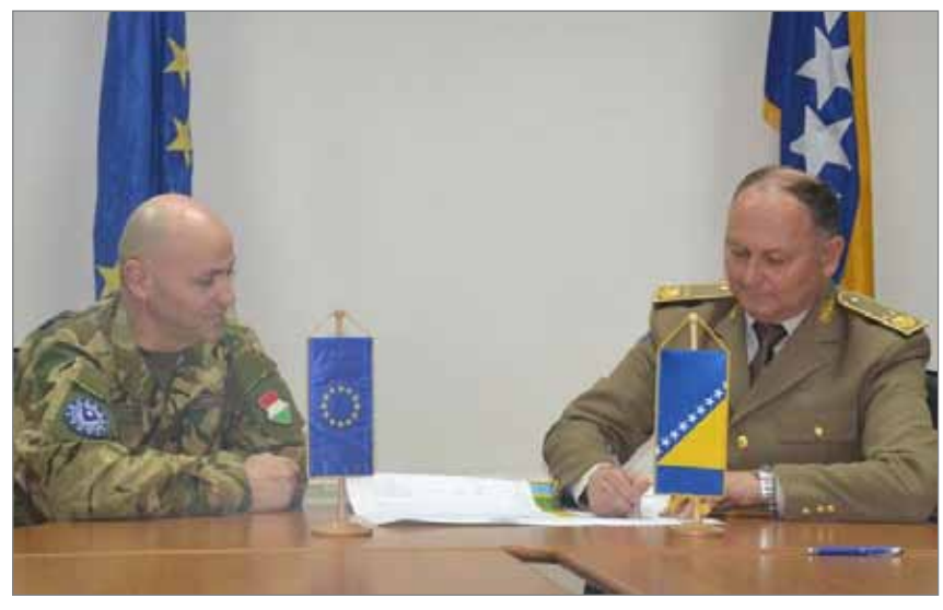
Signature of Joint (Integrated) CB&T Plan 2018

from EUFOR. The key document is the road map agreement with a three years perspective of training cooperation. This road map is the basis for the development of the Joint (Integrated) AFBiH - EUFOR CB&T