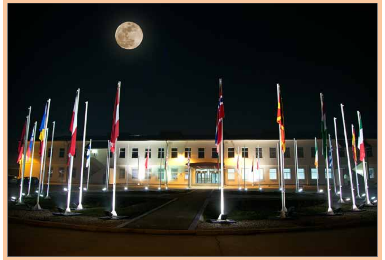
On the night of a 'supermoon' the moon appears larger an brighter than usual. It's a rare astronomical phenomenon. The next 'supermoon' will occur in 2019.