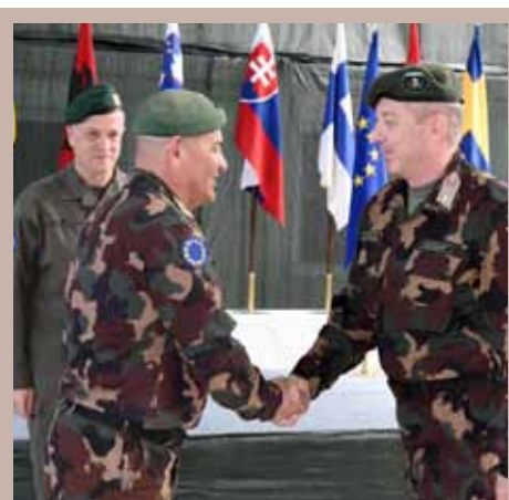
EUFOR Chief of Staff Handover Takeover Ceremony