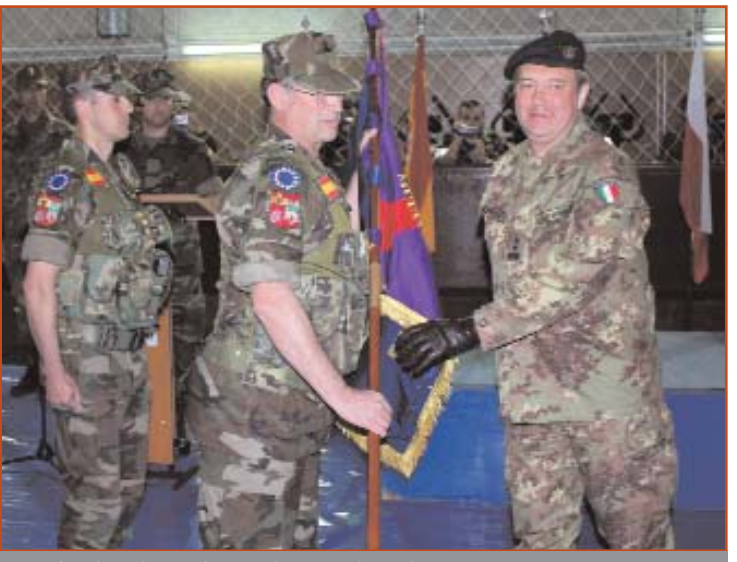
Flag handover during the parade with COM EUFOR MG Castagnottoned COM MNBN Lt Col Ramos-Izquierdo de la Cuadra

The new Spanish contribution to ALTHEA Mission,