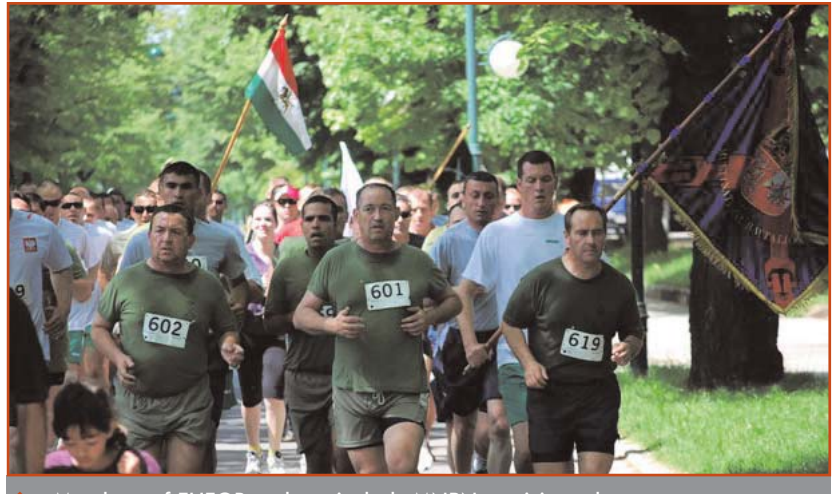
Members of EUFOR and particularly MNBN participated en masse

The Delegation of the European Commission to BiH and the Directorate for European Integrations (DEI), in cooperation with the Association "Marathon Sarajevo" marked Europe Day, 9th May, with a symbolic race called "Trkom u Evropu" (Race to Europe). The race began at 11 o'clock on the Square of Bosnia and Herzegovina. Over 400 runners of all ages and categories entered the race. Many of the participants came from EUFOR.